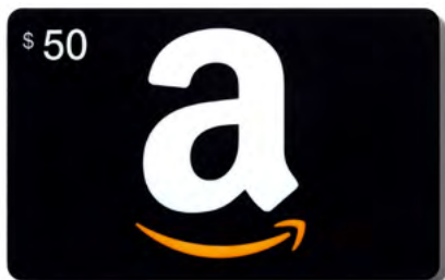
$50 Amazon Gift Card